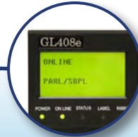
Large LCD Display Panel