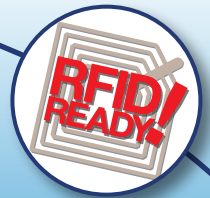
RFID Designed Printer