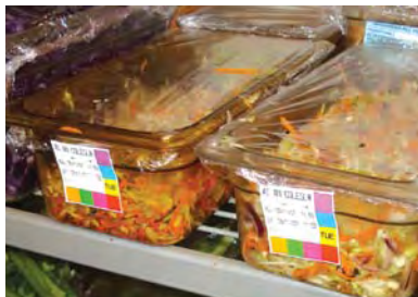
Legible labeling of all products