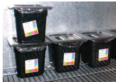
Multiple Adhesive Solutions