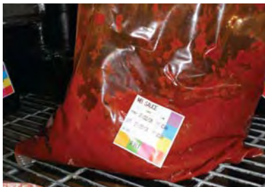
Simple & Effective Food Safety Labels

The DateRight™-Peel labels are cold-temperature-resistant and offer clean removability. The acrylic-based adhesives are designed to adhere firmly, but peel off easily while leaving the substrate unstained and intact.